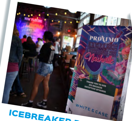
ICEBREAKER DRINKS RECEPTION