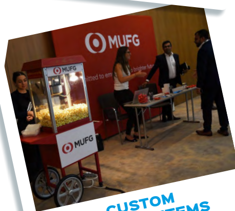
CUSTOM BRANDED ITEMS