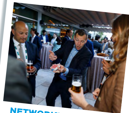
NETWORKING DRINKS RECEPTION