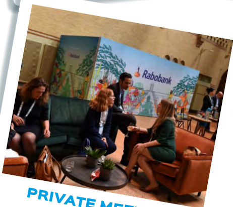
PRIVATE MEETING ROOMS