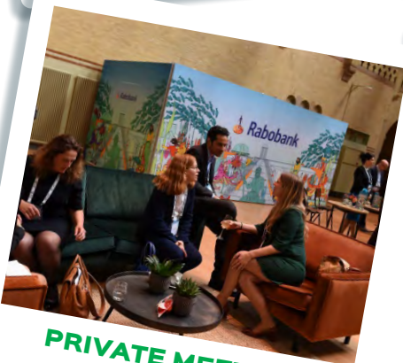
PRIVATE MEETING ROOMS