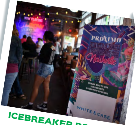
ICEBREAKER DRINKS RECEPTION