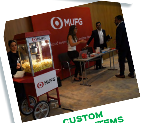
CUSTOM BRANDED ITEMS