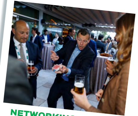
NETWORKING DRINKS RECEPTION