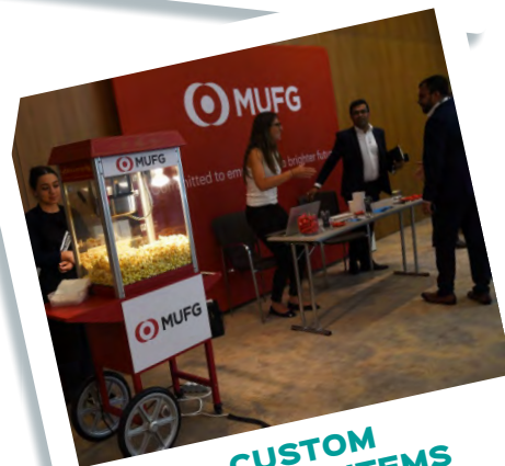
CUSTOM BRANDED ITEMS