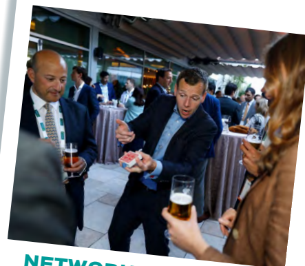
NETWORKING DRINKS RECEPTION