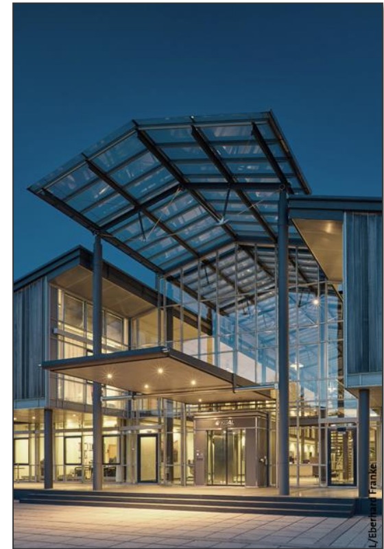
GOAL/KGAL office building in Grünwald/Munich

Tölzer Straße 15 | 82031 Grünwald | Germany