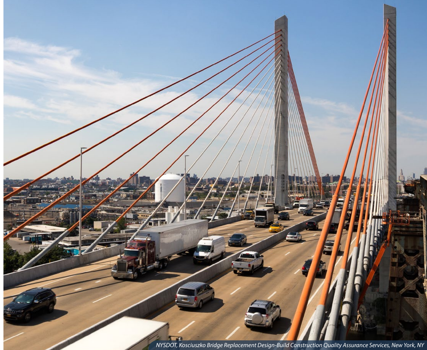
NYS DOT, Kosciuszko Bridge Replacement Design-Build Construction Quality Assurance Services, New York, NY