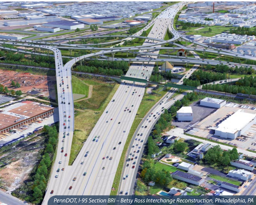
PennDOT, I-95 Section BRI – Betsy Ross Interchange Reconstruction, Philadelphia, PA