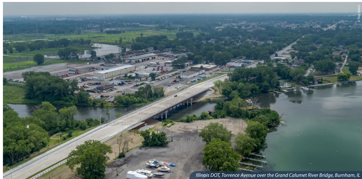
Illinois DOT, Torrence Avenue over the Grand Calumet River Bridge, Burnham, IL