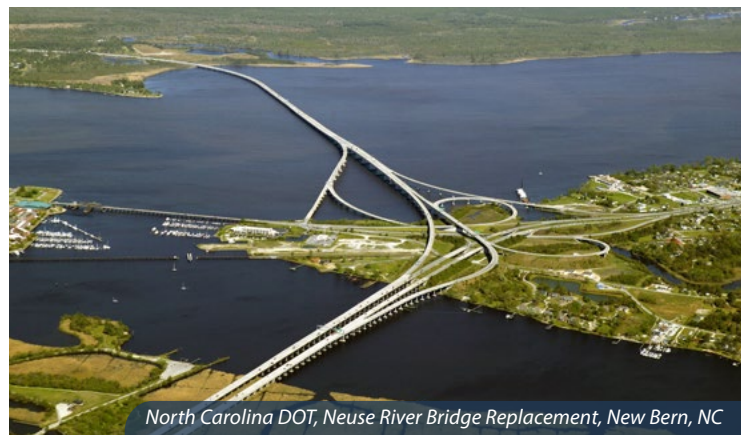
North Carolina DOT, Neuse River Bridge Replacement, New Bern, NC