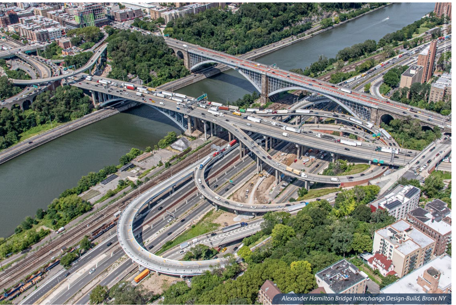
Alexander Hamilton Bridge Interchange Design-Build, Bronx NY