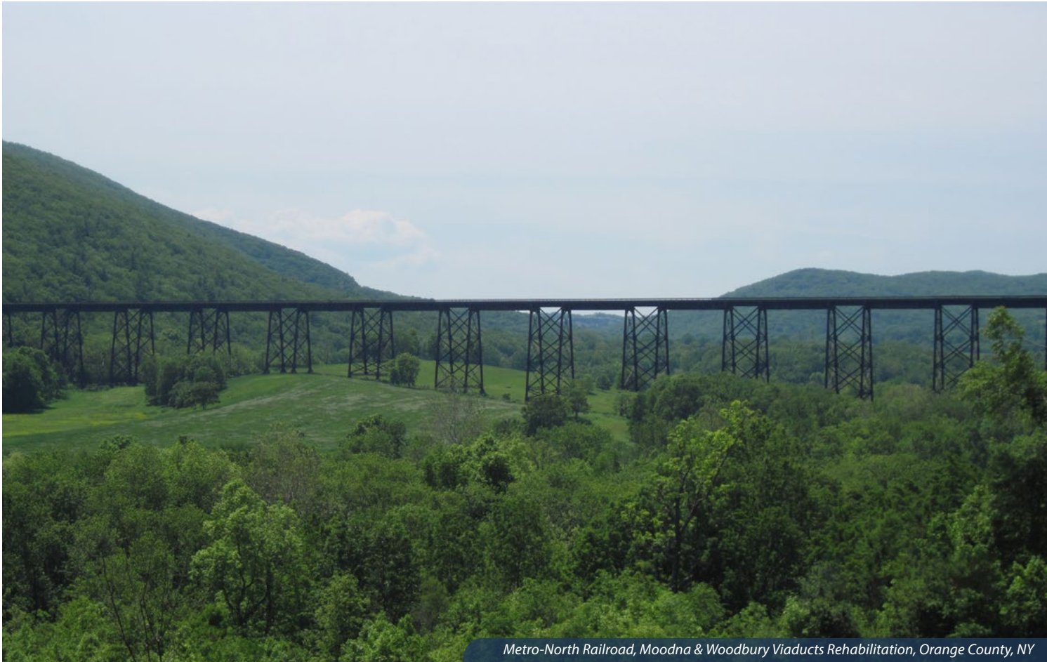
Metro-North Railroad, Moodna & Woodbury Viaducts Rehabilitation, Orange County, NY