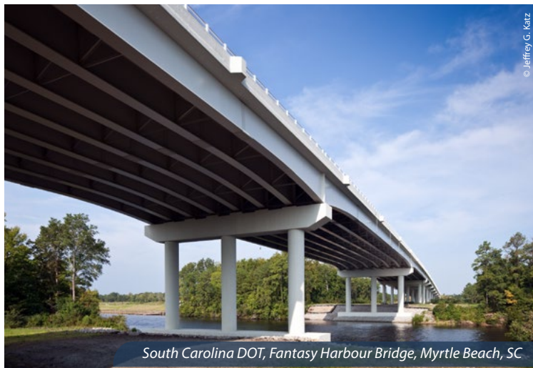
South Carolina DOT, Fantasy Harbour Bridge, Myrtle Beach, SC