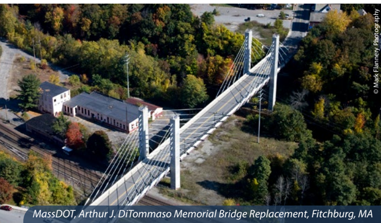
MassDOT, Arthur J. DiTommaso Memorial Bridge Replacement, Fitchburg, MA