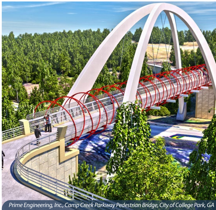
Prime Engineering, Inc., Camp Creek Parkway Pedestrian Bridge, City of College Park, GA