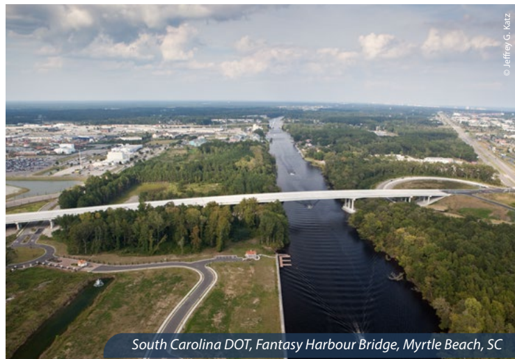
South Carolina DOT, Fantasy Harbour Bridge, Myrtle Beach, SC