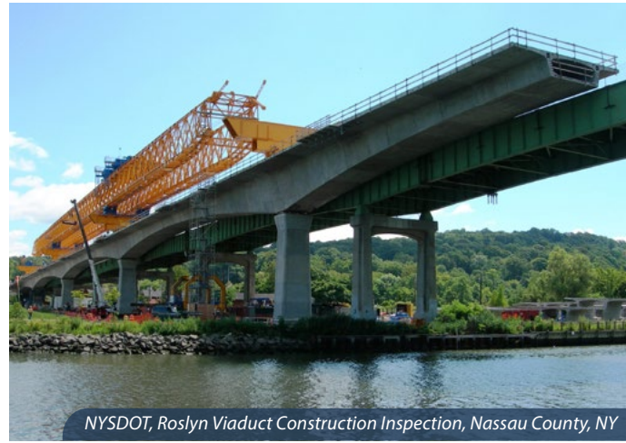
NYSDOT, Roslyn Viaduct Construction Inspection, Nassau County, NY