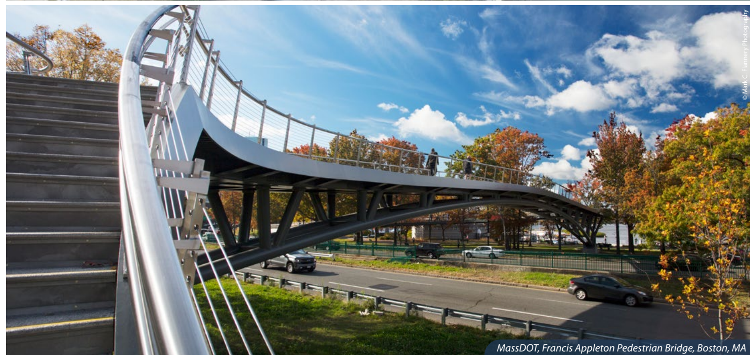
MassDOT, Francis Appleton Pedestrian Bridge, Boston, MA