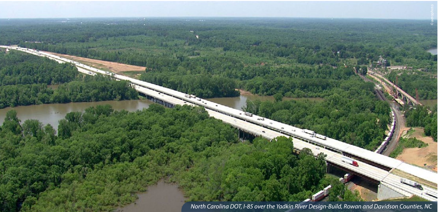
North Carolina DOT, I-85 over the Yadkin River Design-Build, Rowan and Davidson Counties, NC