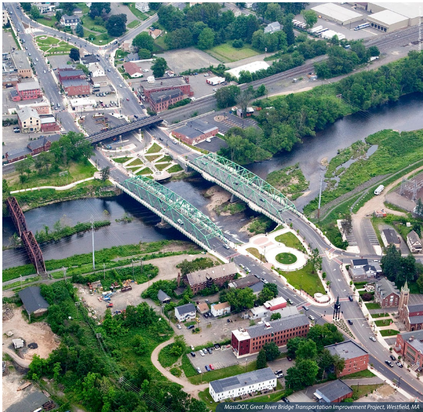
MassDOT, Great River Bridge Transportation Improvement Project, Westfield, MA