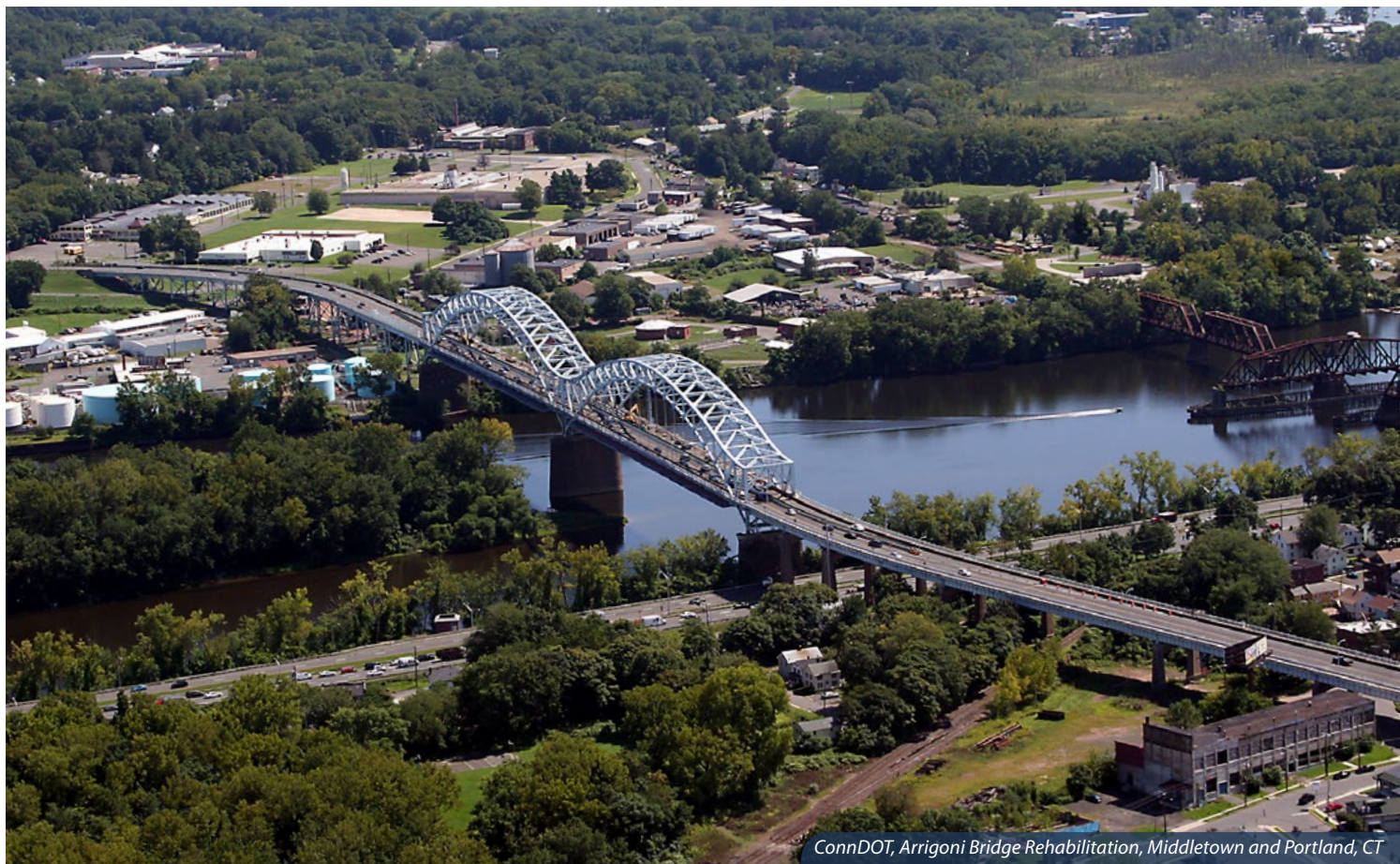
ConnDOT, Arrigoni Bridge Rehabilitation, Middletown and Portland, CT