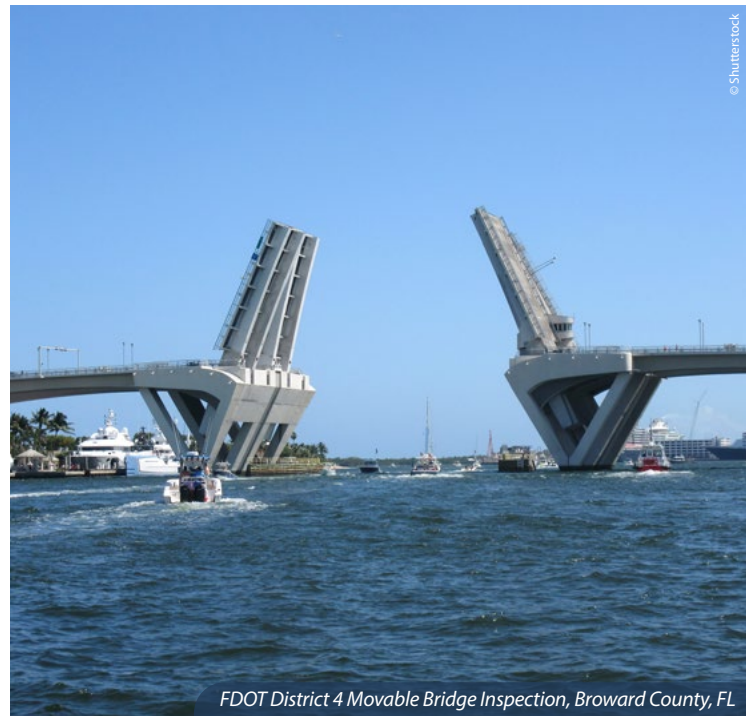
FDOT District 4 Movable Bridge Inspection, Broward County, FL