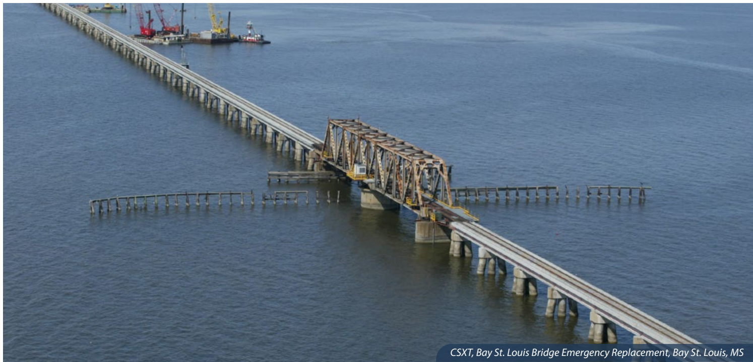
CSXT, Bay St. Louis Bridge Emergency Replacement, Bay St. Louis, MS